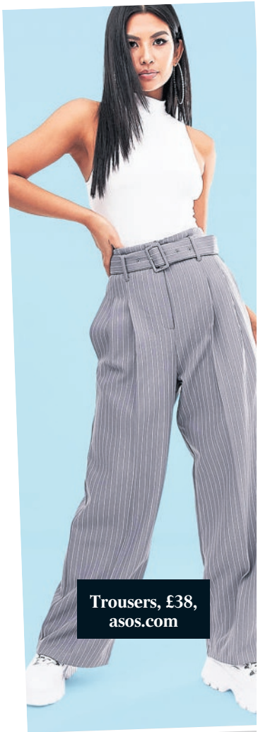
Trousers, £38, asos.com