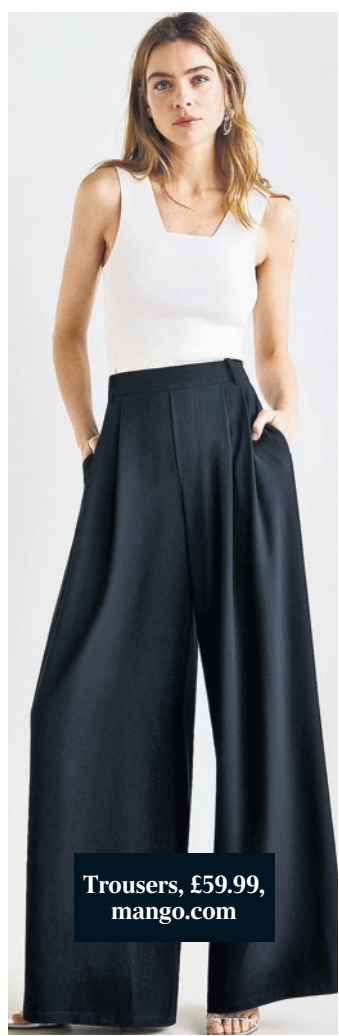
Trousers, £59.99, mango.com